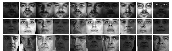
Fig. 3. Example of PIE face images used in our experiment.

We first compare the proposed LGQP feature with some other TUs, including LBP [1], LGBP [11] and LGT [3]. The results are shown in Table 1. Results for each feature are obtain by using \chi^2 similarity measure, and we do not allo-