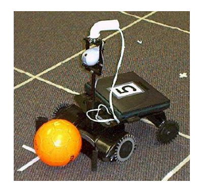
Fig. 1. Minnow robot platform.

drive unit includes a microcontroller which, in addition to controlling the motors, provides odometry and bump sensing. This microcontroller communicates with the host computer through an RS-232 connection.