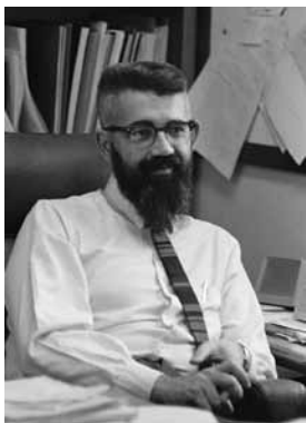
McCarthy in December 1965.

At IBM that summer McCarthy and Rochester persuaded Claude Shannon and Marvin Minsky, then a Harvard junior fellow in mathematics and neurology, to join them in proposing a workshop to be held at Dartmouth during the following summer. McCarthy took the lead in writing the proposal and in organizing what was to be called a “Summer Research Project on Artificial Intelligence.” The proposal 7 was submitted to the Rockefeller Foundation in August 1955. Among other things the proposal stated that the