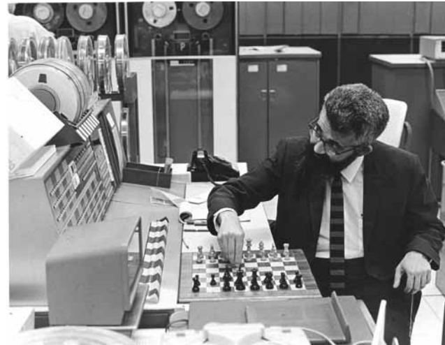
McCarthy in 1966, playing chess against a computer.

In 1959 John invented a technique he called "garbage collection," in which random access memory is freed up by removing code that subsequent computations won't need. That technique was added to LISP